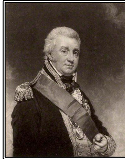
Sir Alexander Inglis Cochrane, Admiral Commander of the Chesapeake fleet.

the first former slaves reached HMS Victorious and soon others followed. On April 1, Admiral Alexander Cochrane assumed command of the Chesapeake fleet, and he wasted no time in declaring his position concerning slavery. In a proclamation issued the next day, he established the British navy's official stand: