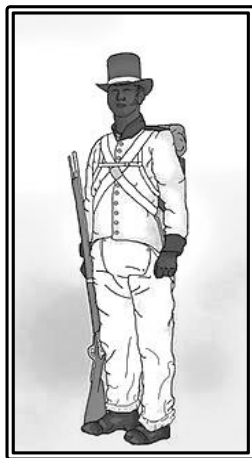
Colonial Marine Uniform. The red jacket would have been worn during battle.

ed themselves With the utmost Order, Forbearance and Regularity, and they were uniformly Volunteers for the Station where they might expect to meet their former Masters.”