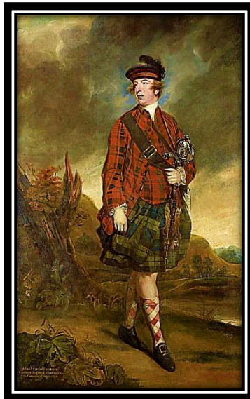
John Murray, 4 th Earl of Dunmore, His Majesty's General Governor of the colony of Virginia.

"The Series of Dangerous Measures pursued by the People of this Colony against Government, which they have now entirely overturned, & particularly their having