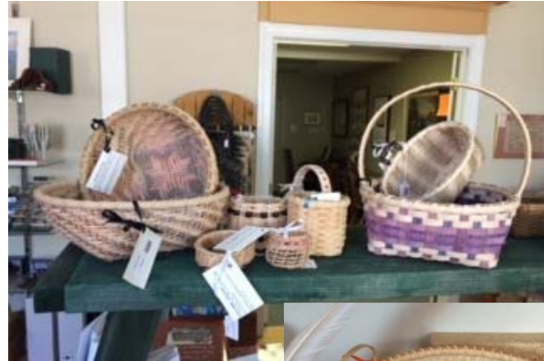
A beautiful basket is the perfect gift for any occasion. Our exclusive collection designed and made by Sam Winter has something for everyone.

Pictured at right are the beautiful baskets designed and crafted solely for the gift shop by Sam Winters. The Nantucket style serving tray (pictured) makes a very special gift for any occasion. There are a variety of baskets all with a "purpose". Utility baskets, mail pouches, garlic baskets, bread baskets, totes and the dainty reasonably priced "jewel gift basket", perfect for a special small gift.