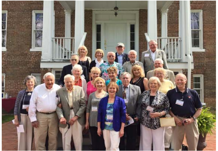
A group of ECMHS docents on the steps at Oakalona during last year's Annual Membership Meeting