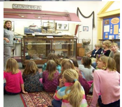
Teachers learn the mysteries of the river and children get a history lesson in the Essex Gallery.