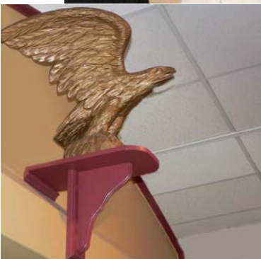
The eagle continues to delight visitors