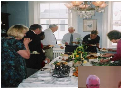
The Annual Members Meeting is a time for food and friendship.